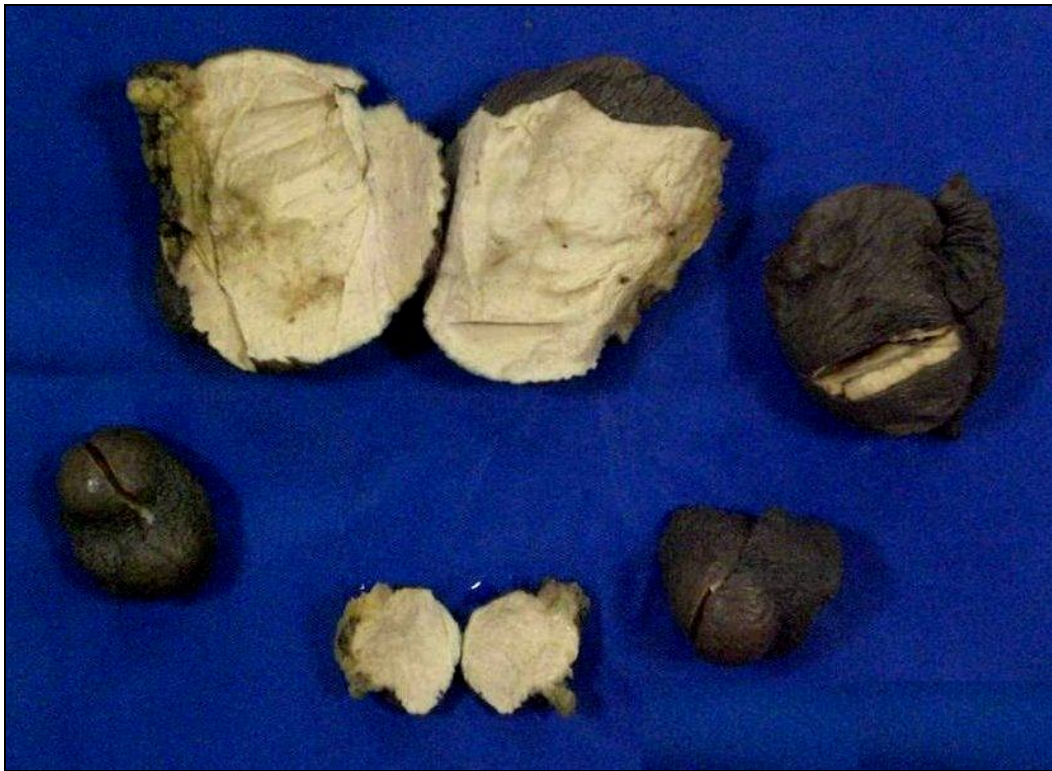
Figure 1. Excised specimen showing multiple skin covered nodules, with a yellow white soft cut section.